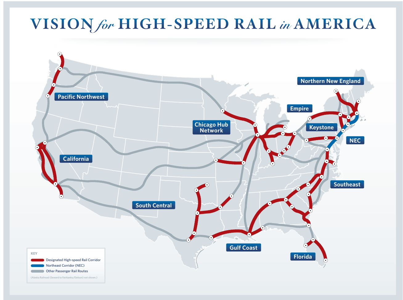
The Federal Railroad Administration's "vision" for high-speed rail includes nearly 800 miles of very-high-speed (top speed of 220 mph, average speed of 140–145 mph) lines in California, about 350 miles of high-speed (top speed of 125 mph, average speed of 80–85 mph) lines in Florida, and about 7,500 miles of moderate-speed (top speed of 110 mph, average speed of 55–75 mph) lines in other parts of the country. It is only a vision, not a real plan, because the FRA has no idea how much it will cost, how to pay for it, who will ride it, or whether the benefits justify the costs. Source: FRA, 2009, tinyurl.com/cvw8s6 .

Given the premium fares charged for high-speed rail, the main users are going to be either wealthy or white-collar workers whose employers are paying the fare. This means the FRA's plan is certain to become a subsidy from ordinary taxpayers to people who are well off and already have plenty of mobility.